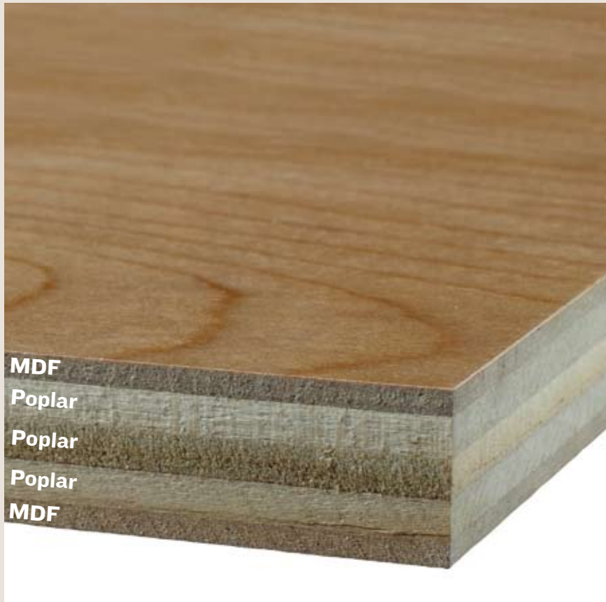
ValueCore C-2 Whole Piece Natural Birch Face with UV clear coating