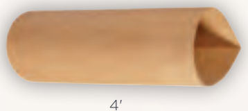
8' x 4' Cross Grain Barrel Bend (1/4" 3 ply product shown here)