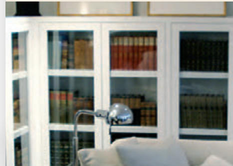
Above – Residential bookcases built with FirstStep pre-primed panels. The FirstStep product was featured in the 25th Anniversary show home in Carlisle, MA for This Old House .

Available from our Old Fort, NC and Hearst, ON Canada operations.