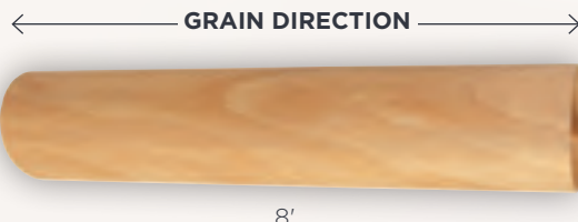
4' x 8' Long Grain Column Bend