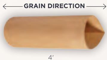
8' x 4' Cross Grain Barrel Bend (1/4" 3 ply product shown here)