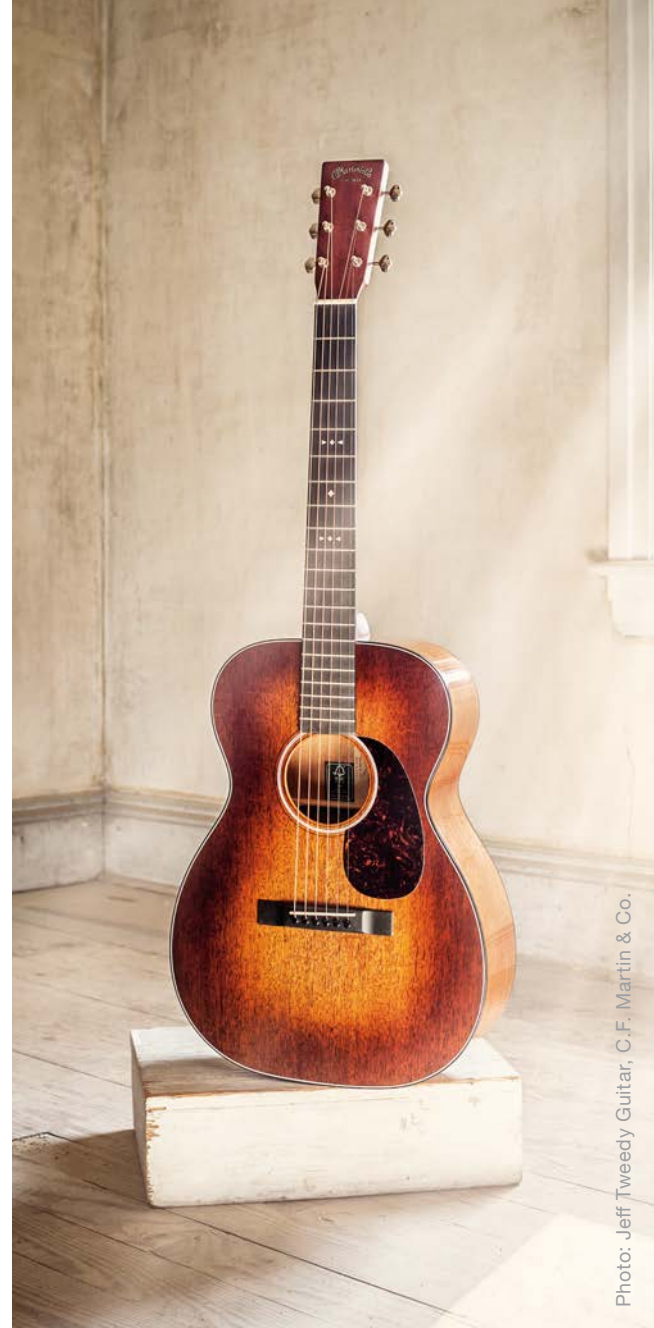
Photo: Jeff Tweedy Guitar, C.F. Martin & Co.