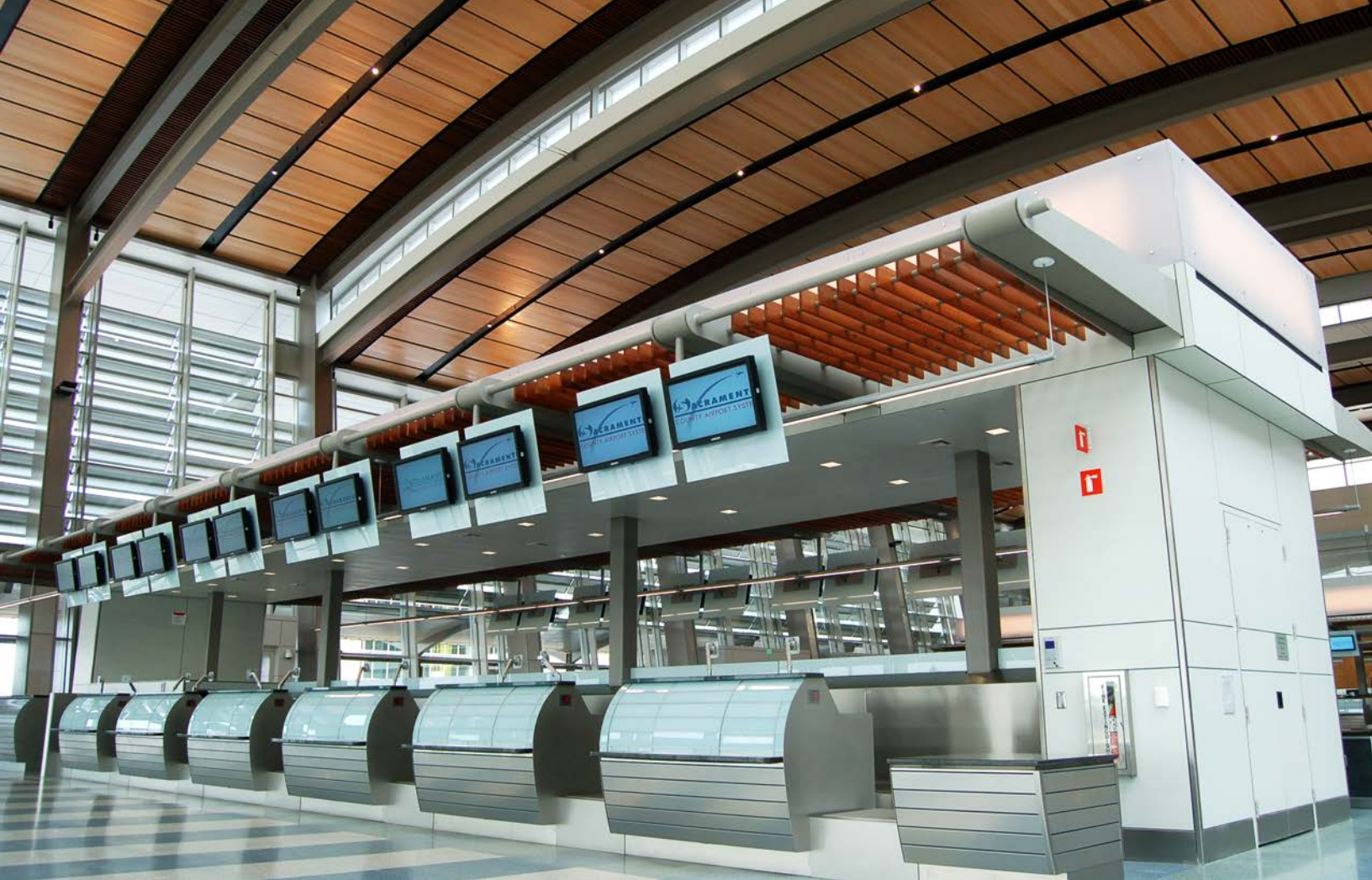
Photo: Sacramento Airport