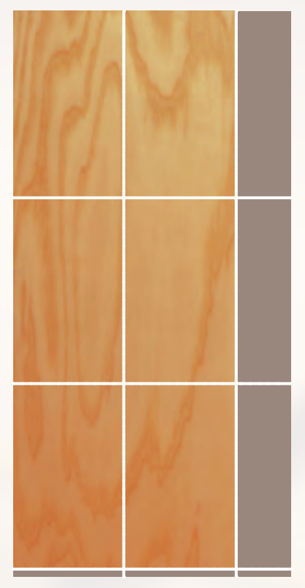
Standard 79% yield 4'x8' panel

What greater yields really mean. This illustration is an example of increased yields for a 19 1/4" x 31 5/8" component utilizing a 5' x 8' panel. If 1,700 pieces were required, 284 four-foot panels would be used vs. 189 five-foot panels. That's 95 fewer panels to handle with a 16% improvement in yield.