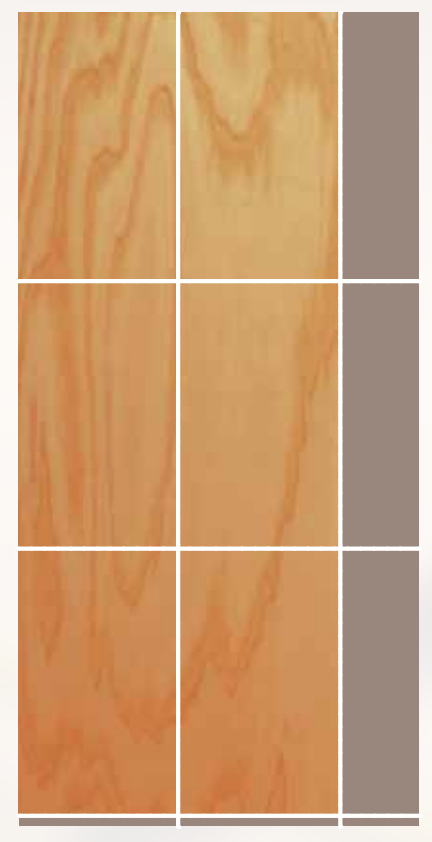
Standard 79% yield 4'x8' panel

What greater yields really mean. This illustration is an example of increased yields for a 19 1/4" x 31 5/8" component utilizing a 5' x 8' panel. If 1,700 pieces were required, 284 four-foot panels would be used vs. 189 five-foot panels. That's 95 fewer panels to handle with a 16% improvement in yield.