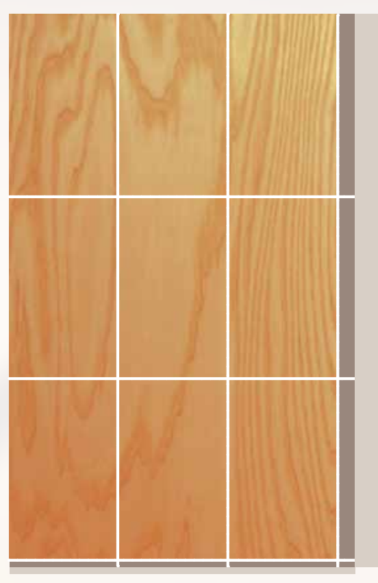
New 95% yield 5'x8' panel