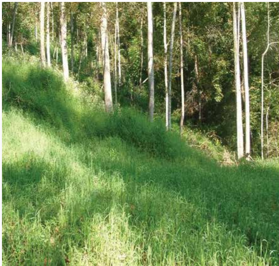
A log landing that was revegetated to create a wildlife food plot after completion of logging, promoting multiple land use.

Columbia Forest Products is the leading manufacturer of hardwood plywood and hardwood veneer across the United States and Canada.