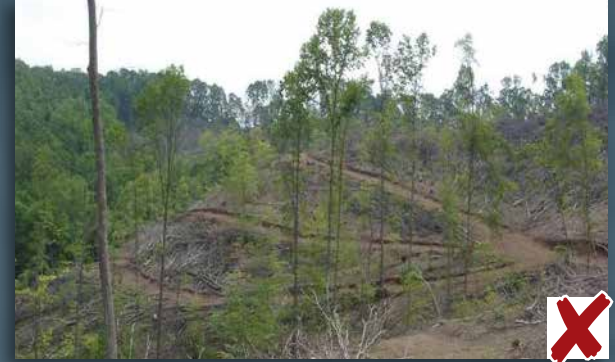
Too many skid roads