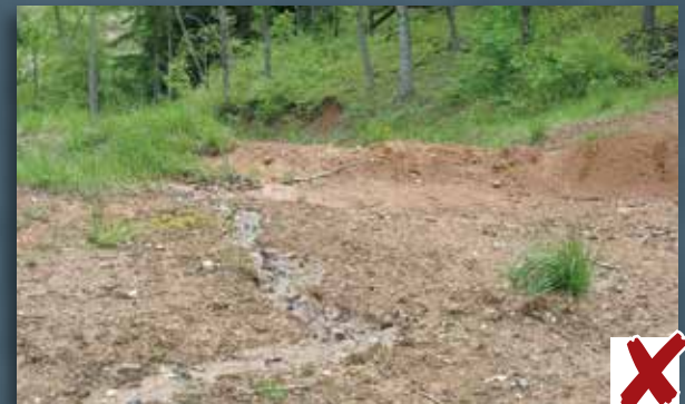
Erosion caused by improperly seeding a log landing