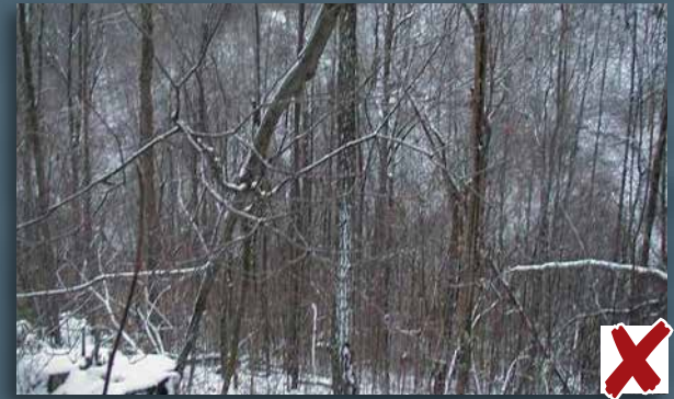
"High-Graded," only the best trees were harvested