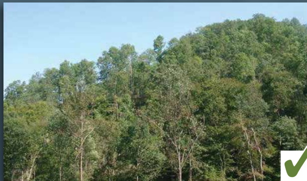
Single tree selection