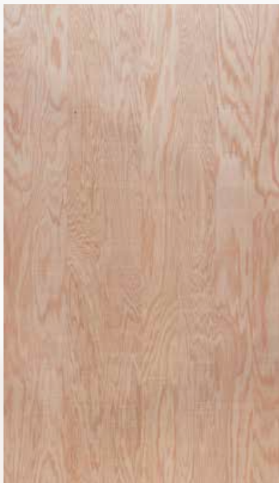
CLEAR RED OAK

These new Rough Sawn wood panels are unique to the woodworking market. Fabricators and designers are encouraged to ask for samples they can finish to assure client expectations. Care should be given to the unique effect of the surface qualities and seam lines on the finished look of these revolutionary panel faces.