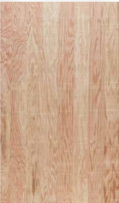
COLORFUL RED OAK