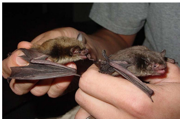
Little brown bat (left), Indiana bat (right).

Portions of this article condensed from, USGS, National Wildlife Health Center, "White-Nose Syndrome", May 2014.