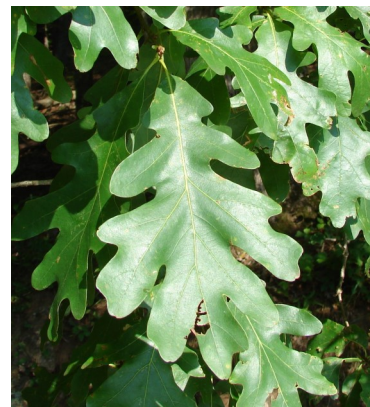
Leaves of Quercus alba , white oak

Even age silviculture is most suitable for favoring white oaks. Harvesting of mature oaks needs to be timed with abundant acorn production. Seedling production will occur during the next year or two. Once white oak seedlings are established, then overstory management or harvesting can occur. Ideally, you are waiting on seedlings to reach poles sizes (1 to 3 inch diameters) before harvesting mature trees. On good sites, white oaks can reach maturity in 60 to 80 years; over 100 years on poorer sites.