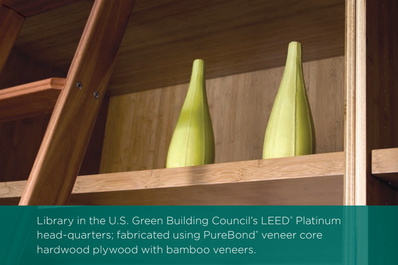
Library in the U.S. Green Building Council's LEED® Platinum head-quarters; fabricated using PureBond® veneer core hardwood plywood with bamboo veneers.