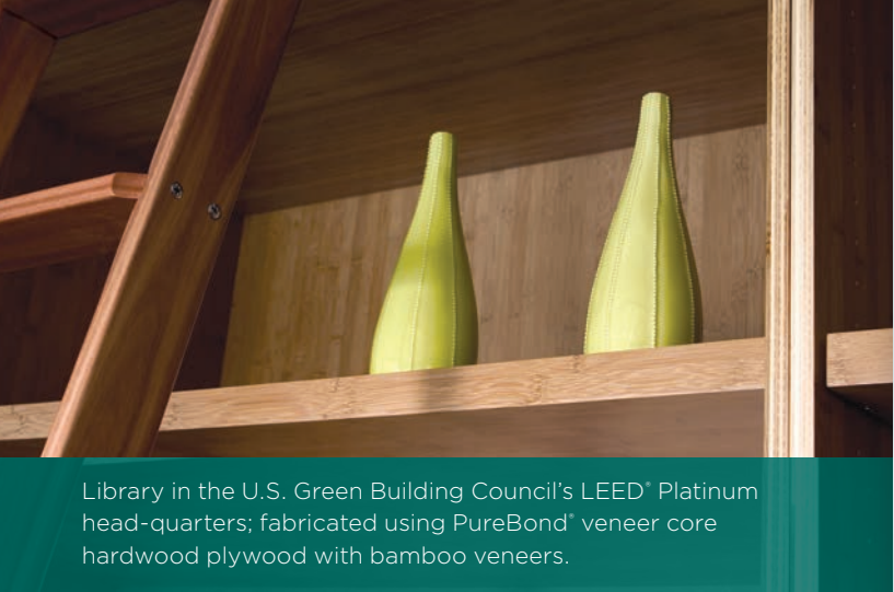
Library in the U.S. Green Building Council's LEED® Platinum head-quarters; fabricated using PureBond® veneer core hardwood plywood with bamboo veneers.