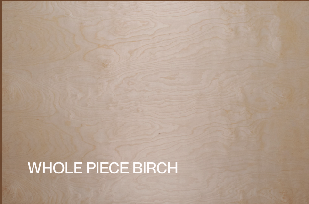
WHOLE PIECE BIRCH