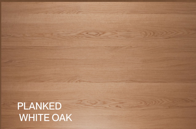
PLANKED WHITE OAK