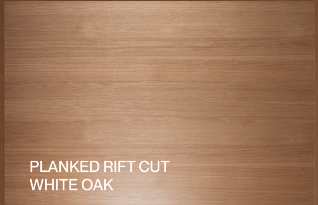
PLANKED RIFT CUT WHITE OAK