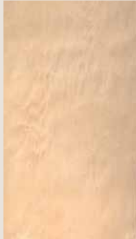
Sap Hard Maple