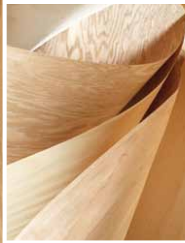
Rotary Cut and Plain Sliced Veneer